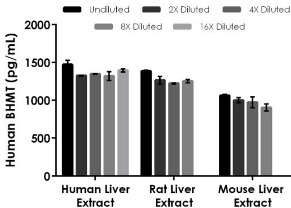
Figure 2. Interpolated concentrations of native BHMT in human, rat and mouse samples based on a 31, 6.3, and 0.5 \mu\text{g/mL} extract load. The concentrations of BHMT standard curve and corrected for sample dilution. The interpolated dilution factor corrected values are plotted (mean \pm SD, n=2 ). The mean BHMT concentration was determined to be 1373 pg/mL in human liver extracts, 1282 pg/mL in rat liver extracts and 985 pg/mL in mouse liver extracts.